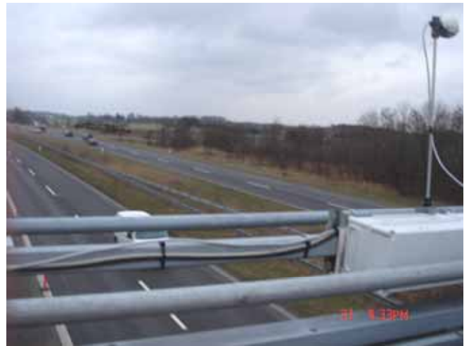
Collect-R installed on existing structures (e.g. VMS panels).

Integrated data is stored in the sensor and can easily be transferred via an open protocol SDK (Traficon Management System) or an off-line download tool. Downloading this data to a PC can be done locally or remotely. This transmission of data can be done at predefined times or on command of the operator.